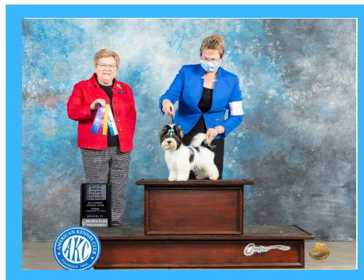
Buster (Biewer Terrier)