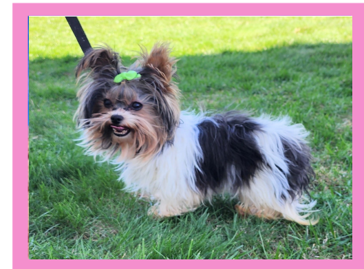
Star (Biewer Terrier)