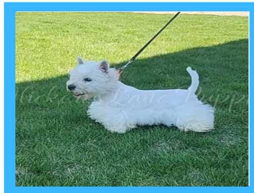
Hickory Lanes Lotrando Sparky (West Highland White Terrier)