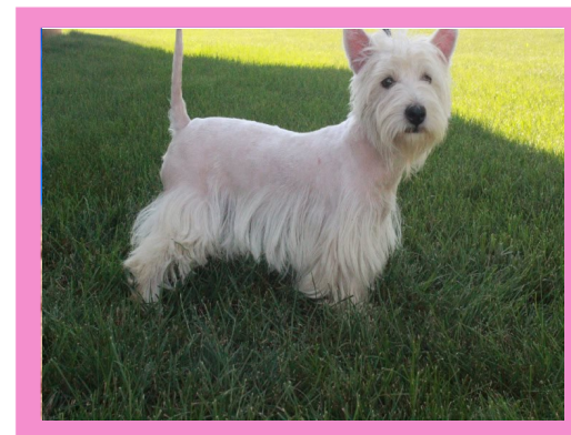
Nellie (West Highland White Terrier)