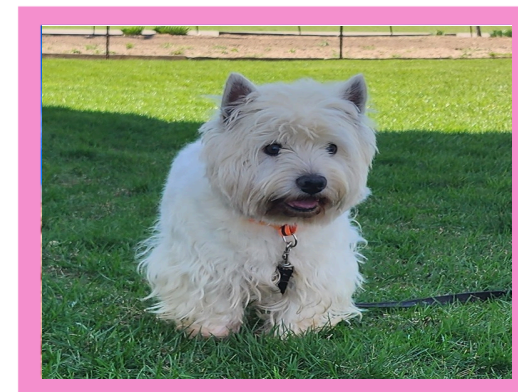
Sophie (West Highland White Terrier)